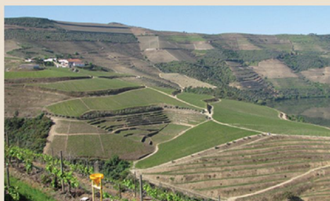
6. Alto Douro