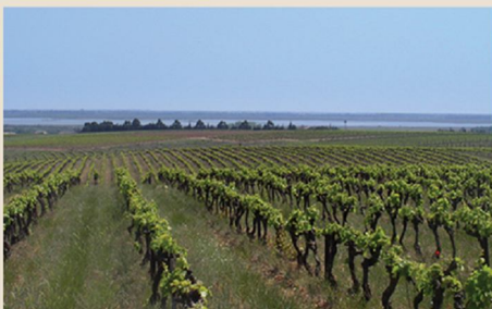
2. Costières de Nîmes