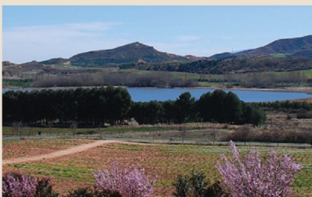
5. La Grajera