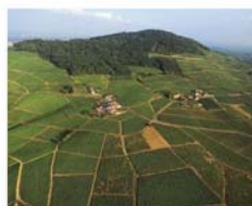
Brouilly et Côte de Brouilly