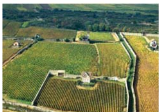
Côte de Beaune méridionale