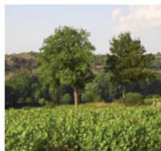
Val de Loire