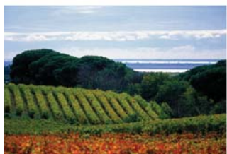
Costières de Nîmes