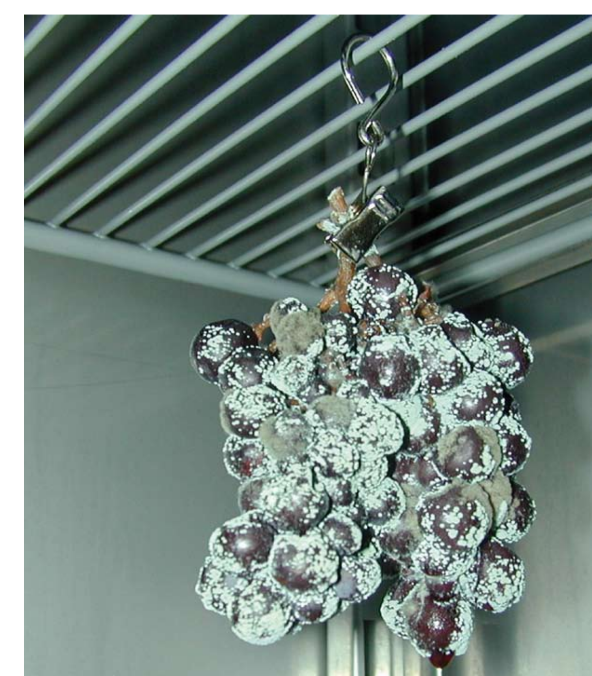
Inoculation of P. expansum on Gamay berries

These two last parameters were controlled in a climatic chamber (photo).